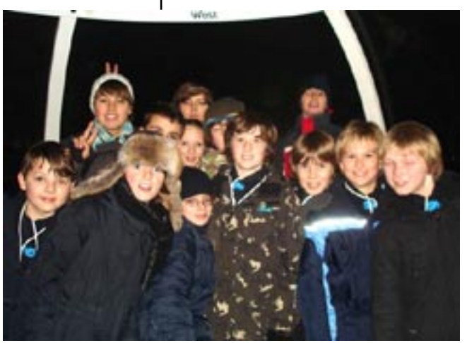
Scouts on the 'London Eye' at Christmas